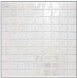
Opalo 1X1 Blanco