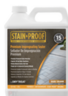
DRYTREAT Stain-Proof Premium Impregnating Sealer